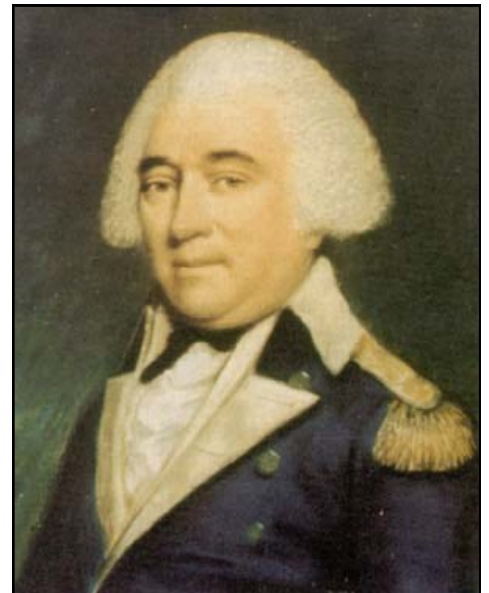
"Anthony Wayne, uniform" by James Sharples

In 1781, Wayne was commanding officer of the Pennsylvania line when conditions led to the Pennsylvania line mutiny, a serious issue only resolved by dismissing half the troops. After delays replenishing the ranks and dealing with subsequent complaints about devalued pay, Wayne joined Lafayette in Virginia. After the British surrender at Yorktown, Wayne was sent to South Carolina and then Georgia to break the British alliance