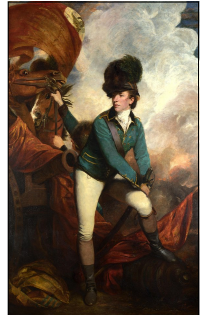
"Portrait of Sir Banastre Tarleton" By Joshua Reynolds

Daniel Morgan died July 6, 1802 at Winchester, Virginia on his 66th birthday.