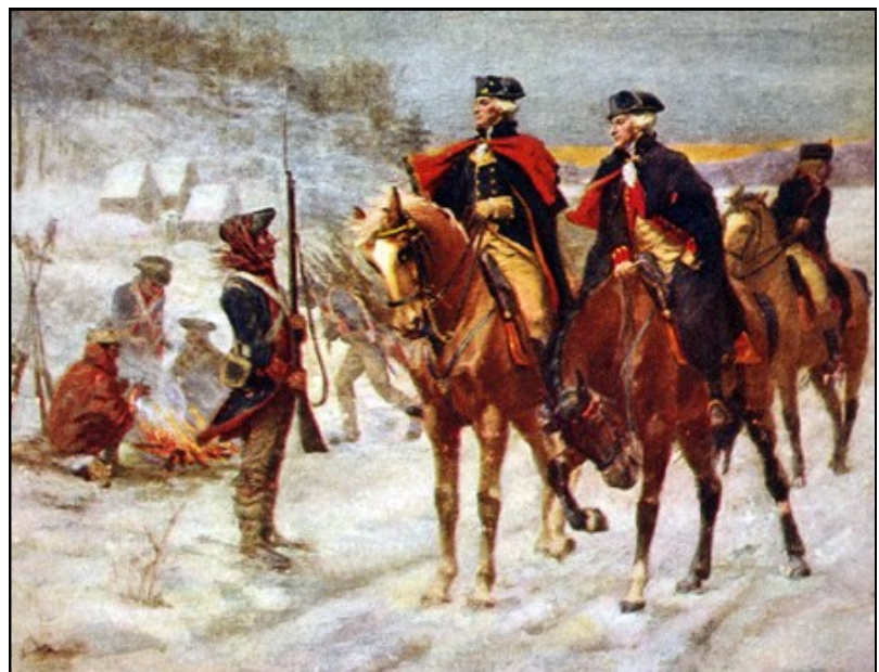
"Washington and Lafayette at Valley Forge" By John Ward Dunsmore